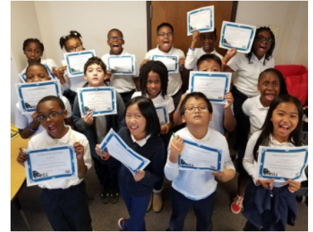
BRK Curriculum Certificate