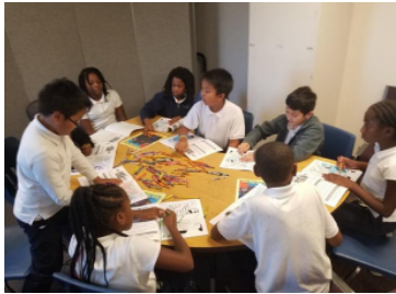
BRK Classroom / Community & Civic Groups' Workshops

Facebook / Instagram / Twitter / YouTube / LinkedIn