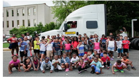
BRK "Touch-A-Truck" Career Program